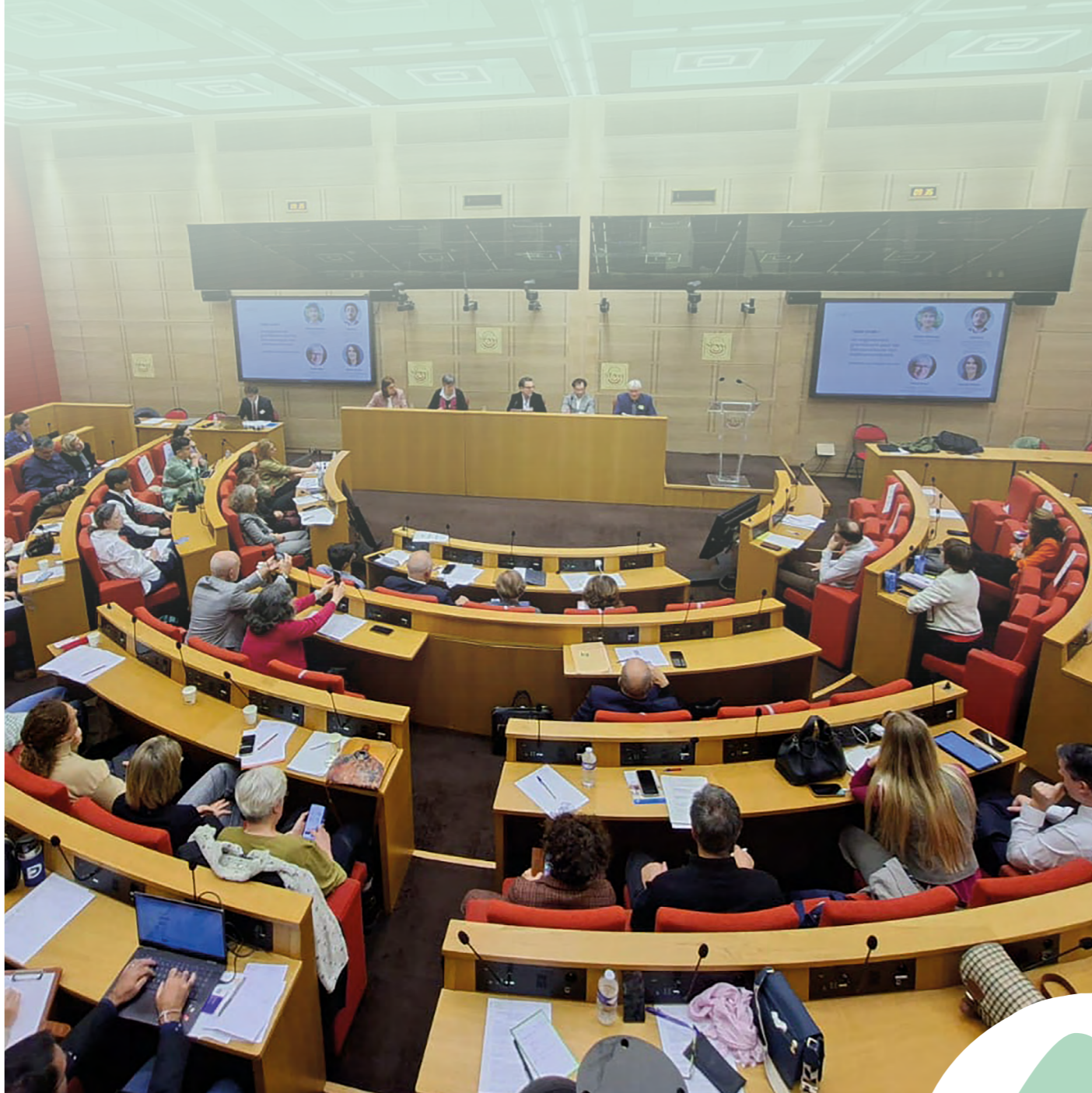
Conference on "Prevention, treatment and support with a different approach... the contribution of non-pharmacological therapies" at the Senate, October 2025

By supporting professional associations, citizen initiatives and engaged groups in communities, the Foundation is helping to change attitudes and promote the value of a more holistic approach to care.