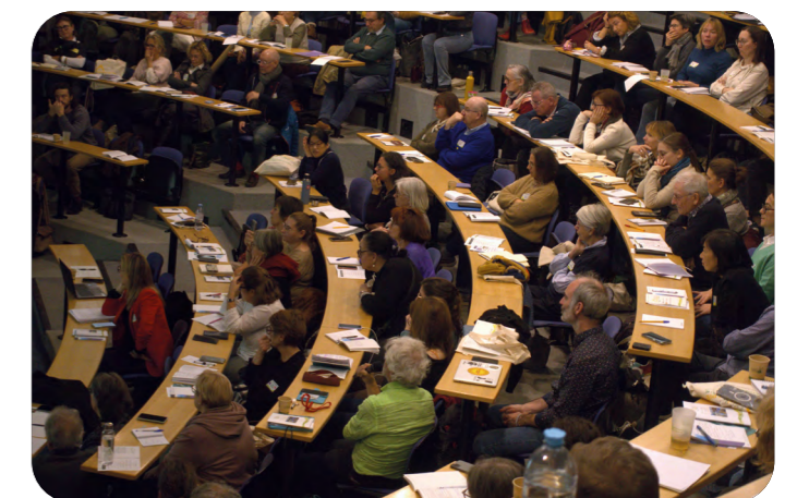
Attendees at the 2nd Clinical Aromatherapy Conference, in Strasbourg, November 2025

Finally, AFAC organised its second conference on clinical aromatherapy in Strasbourg. The Foundation helped organise this event, which attracted nearly 200 participants.