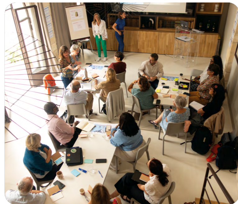
Collective intelligence workshop

The Foundation convened this group at a seminar organised in September 2025 at Mas Bellile in Saint-Rémy-de-Provence, a historic site for the Gattefossé Group. Collective intelligence workshops held in this special setting led to a collective being built that is founded in a “One Health” approach. Their ambition is to develop joint research projects to assess the potential of essential oils as a lever in the fight against antibiotic resistance.