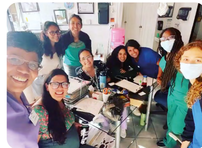
A group of volunteers working with pregnant women at the Tijuana camp

These women, mainly from Central America, live in extremely precarious conditions, unable to either cross the border or return to their country of origin.