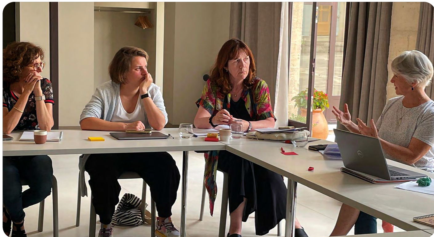
A collective intelligence workshop in St-Rémy-de-Provence

The working session to draft this article was held at Mas Bellile, in Saint-Rémy-de-Provence, in June 2025. The article is being submitted and will be published in 2026.